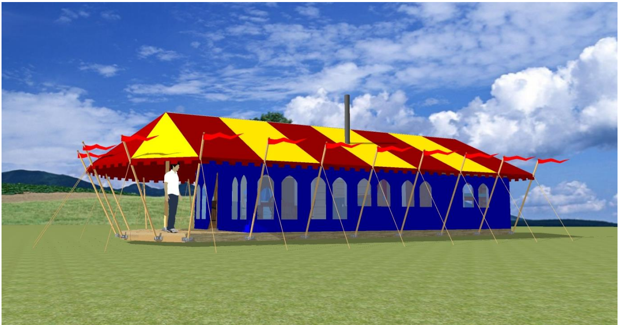
Image 2 - standard 9m x 5m Tsavo with medieval styling